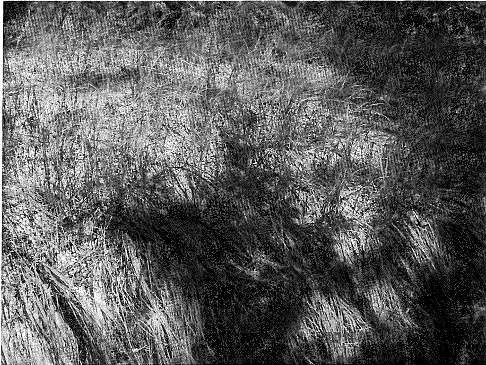
Photo 15 – Site 1 downstream measurement location looking to left bank.