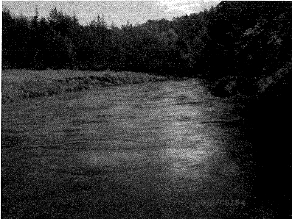
Photo 18 – Site 2 upstream measurement location looking downstream.