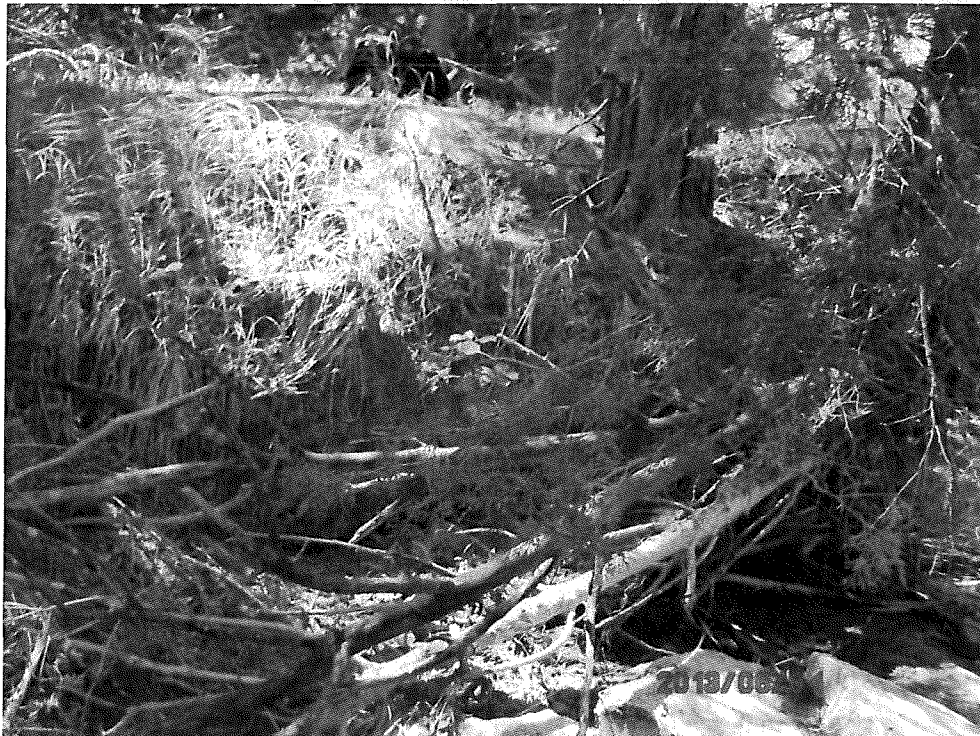
Photo 16 – Site 1 downstream measurement location looking to right bank.