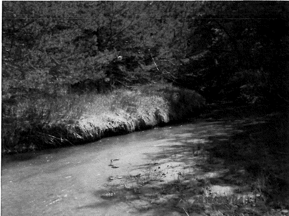
Photo 10 – Site 1 downstream from culvert measurement location looking downstream.