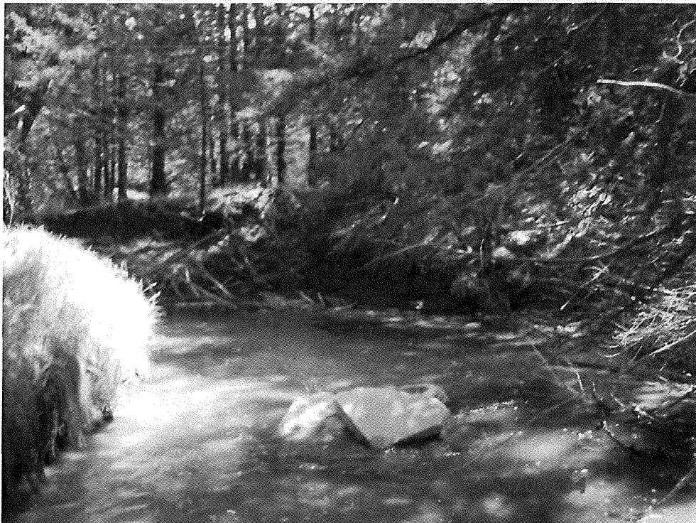
Photo 14 – Site 1 downstream measurement location looking downstream.