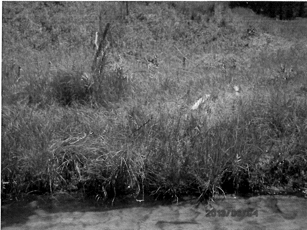
Photo 36 – Site 4 upstream measurement location looking to right bank.