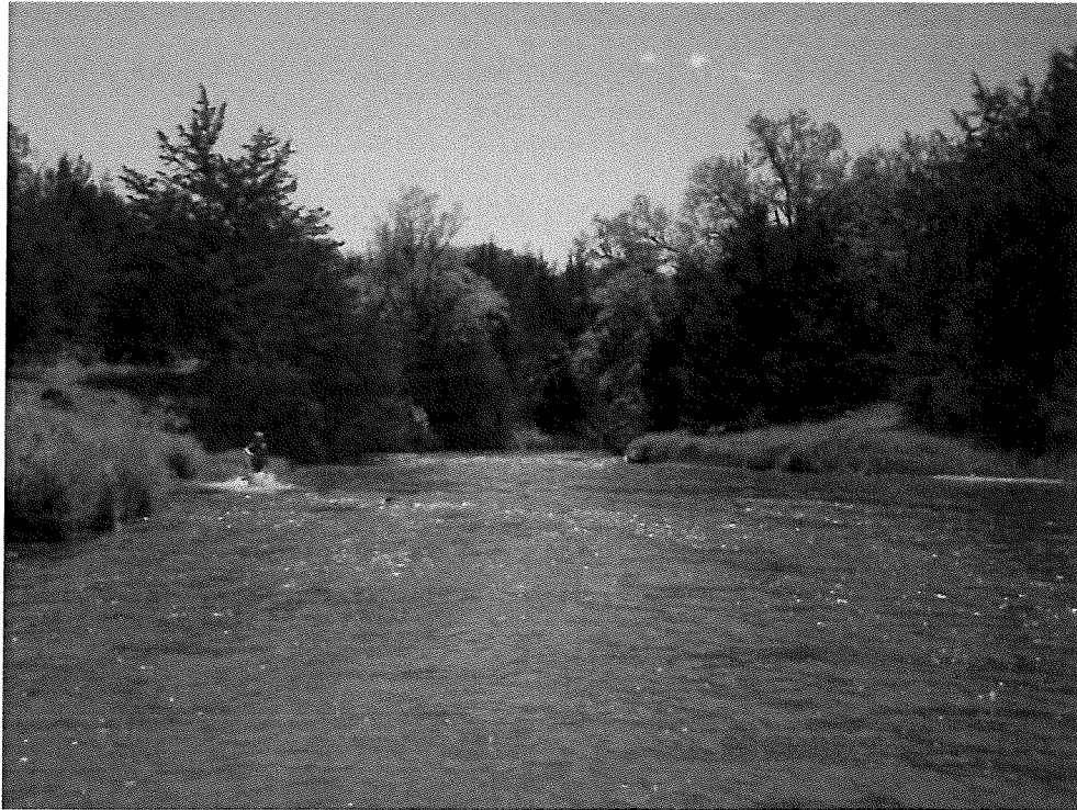
Photo 37 – Site 4 midstream measurement location looking upstream.