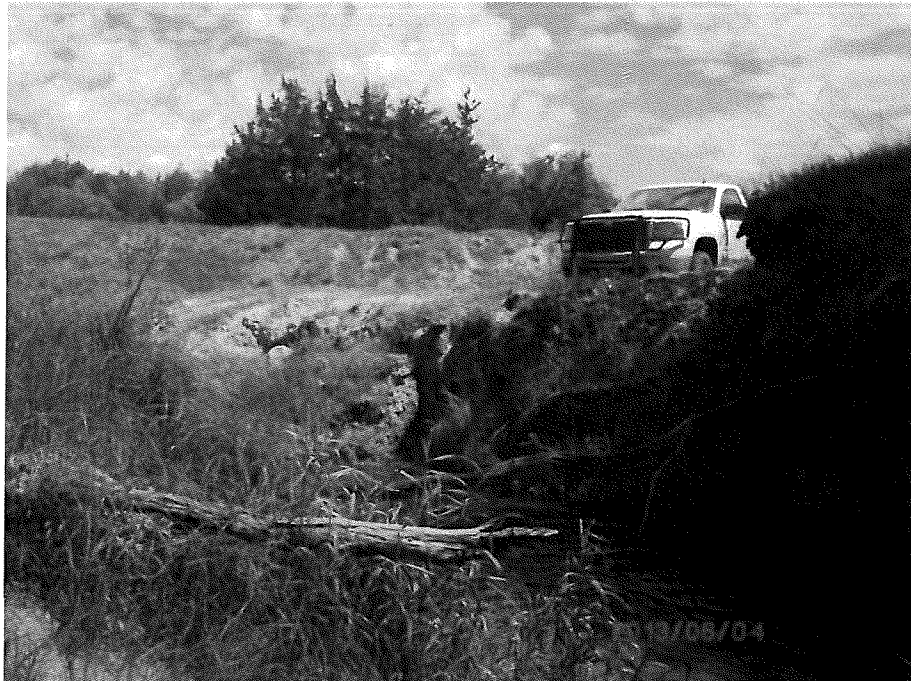
Photo 2 – Site 1 upstream measurement location looking downstream.