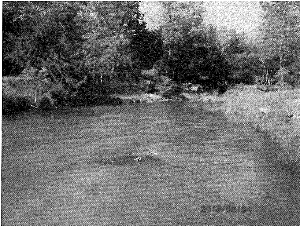
Photo 21 – Site 2 midstream measurement location looking upstream.