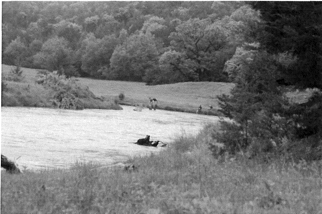
Photo 15 - Measuring habitat and conducting flow measurements near the top of site PC3.