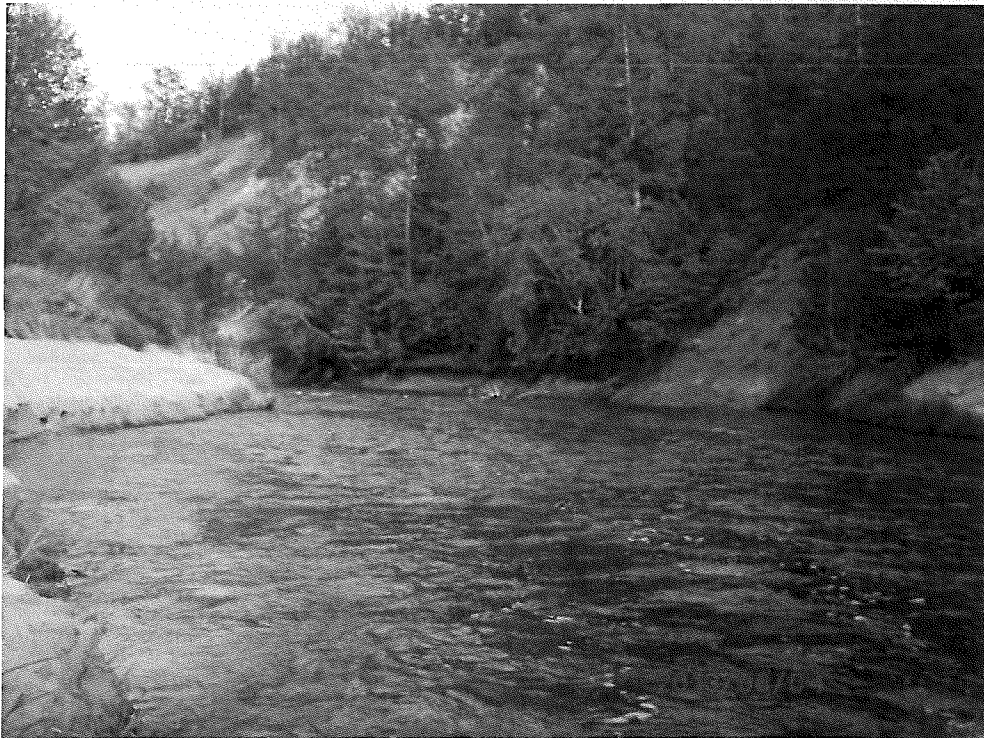
Photo 30 – Site 3 downstream of dam measurement location looking downstream.