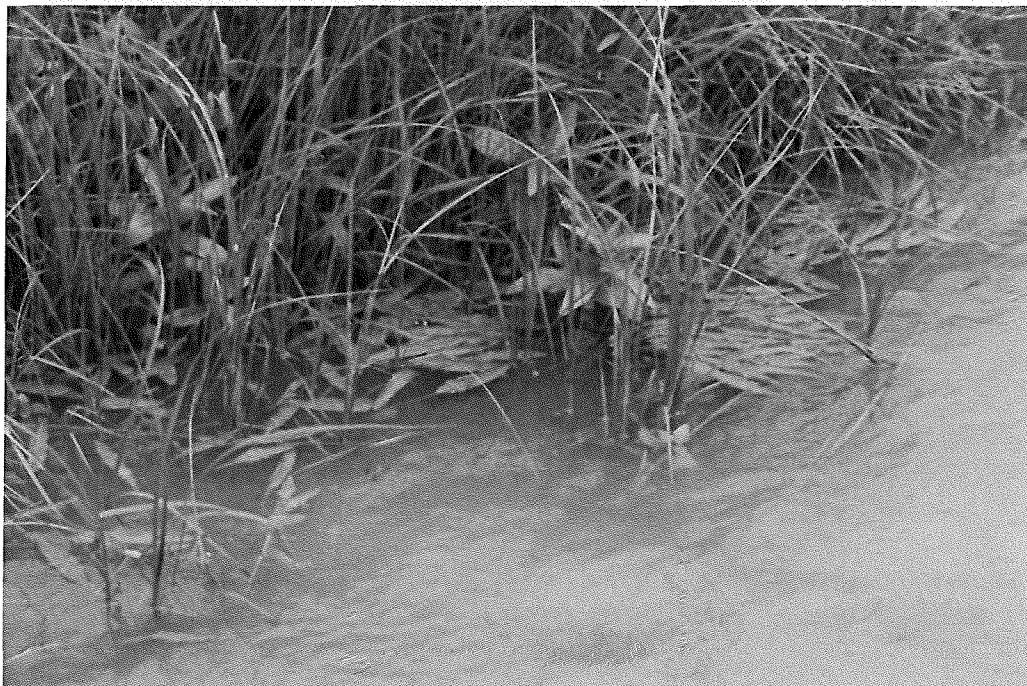
Photo 16 - Significant observation of Potamogeton nodosus growing at site PC3. Strong indicator of sediment stability.