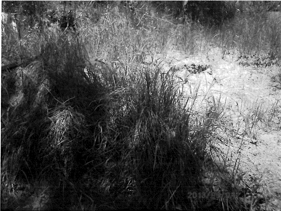
Photo 3 – Site 1 upstream measurement location looking to left bank.