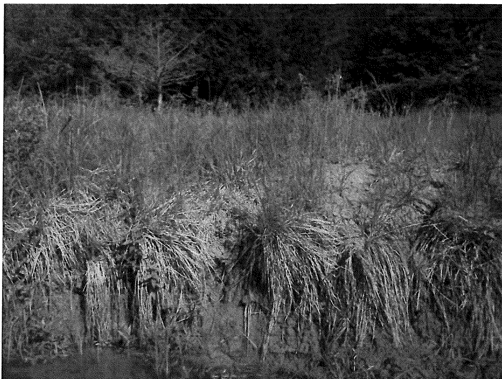
Photo 27 – Site 2 downstream measurement location looking to left bank.