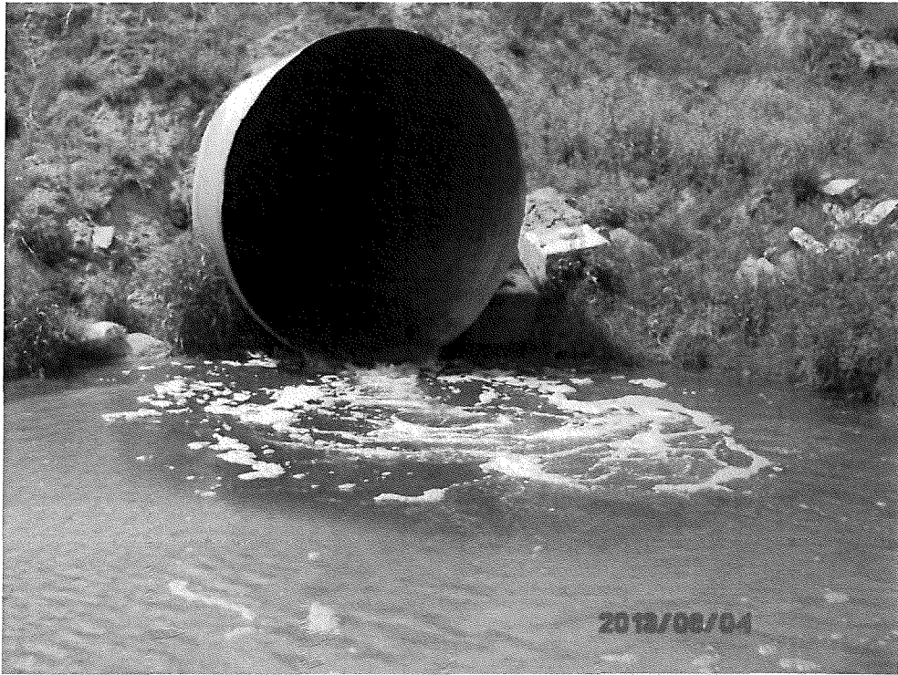
Photo 9 – Site 1 downstream from culvert measurement location looking upstream.