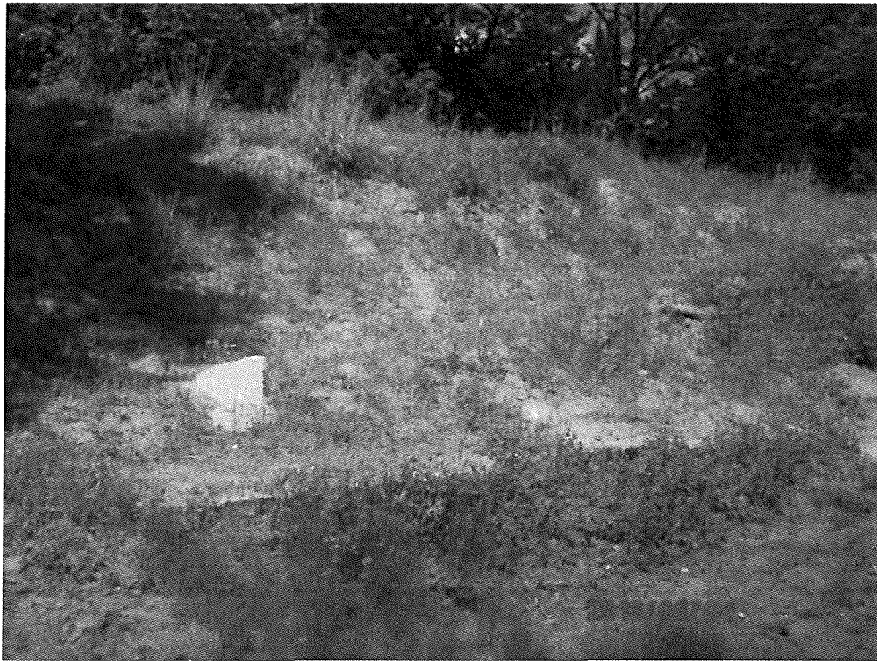
Photo 7 – Site 1 upstream from culvert measurement location looking to left bank.