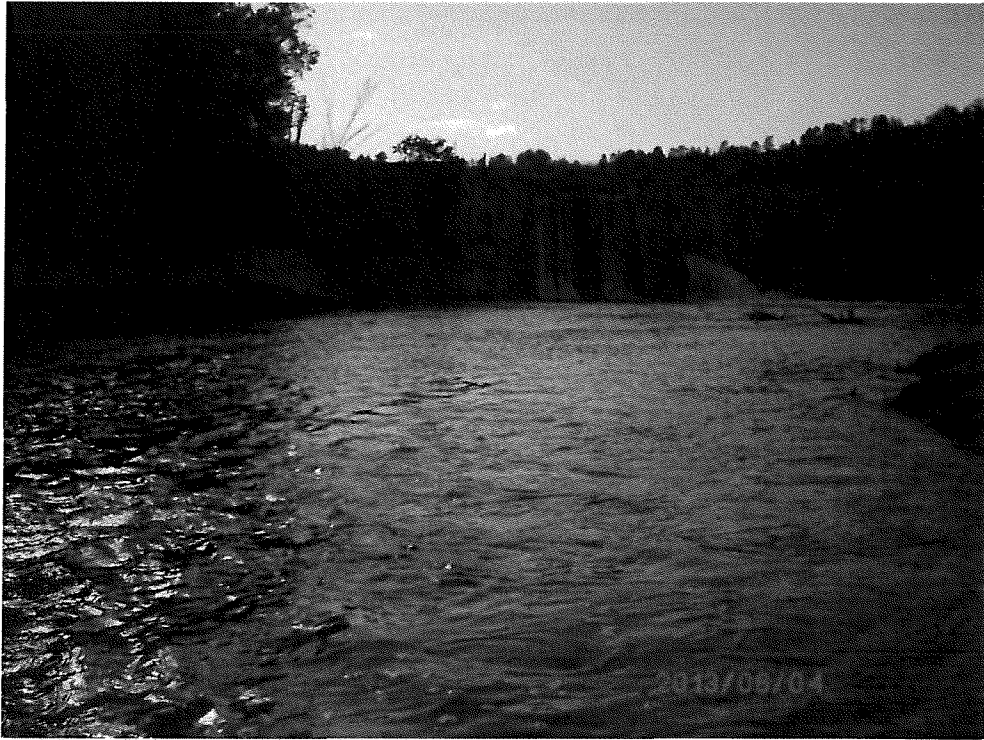
Photo 29 – Site 3 downstream of dam measurement location looking upstream.