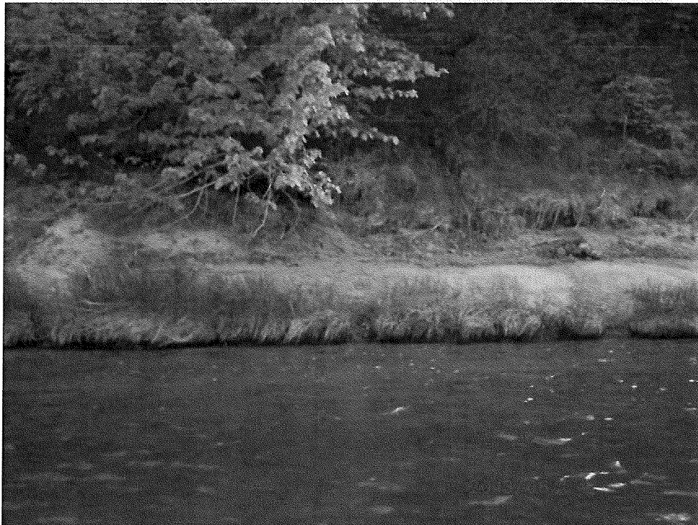
Photo 32 – Site 3 downstream of dam measurement location looking to right bank.