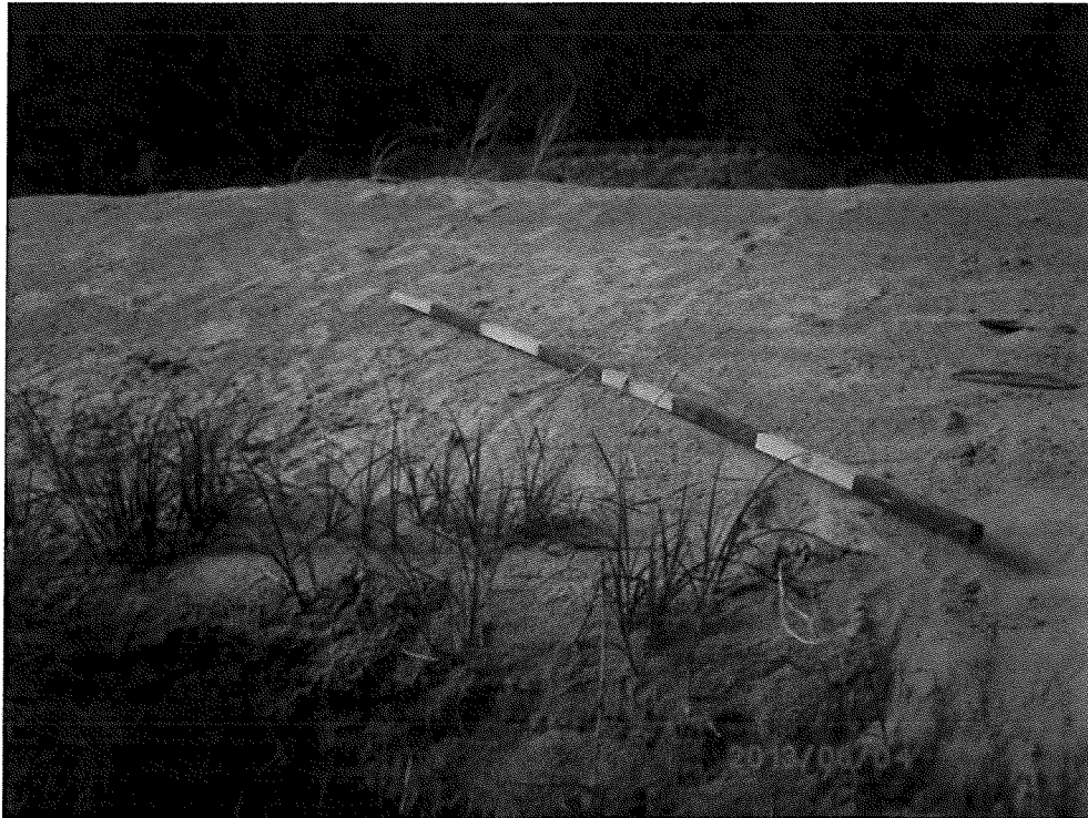
Photo 31 – Site 3 downstream of dam measurement location looking to left bank.