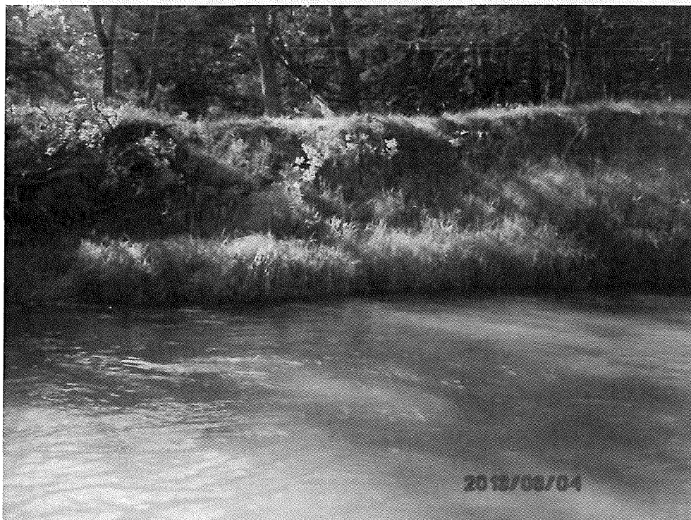
Photo 28 – Site 2 downstream of dam measurement location looking to right bank.