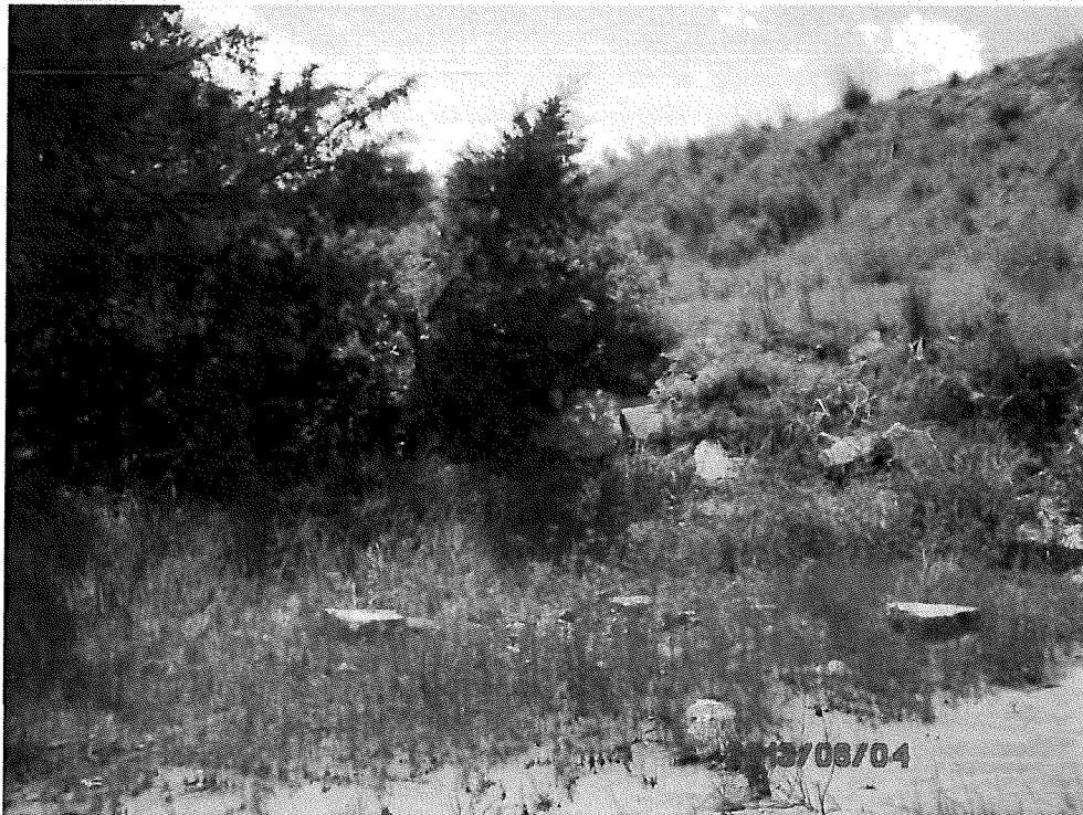
Photo 12 – Site 1 downstream from culvert measurement location looking to right bank.