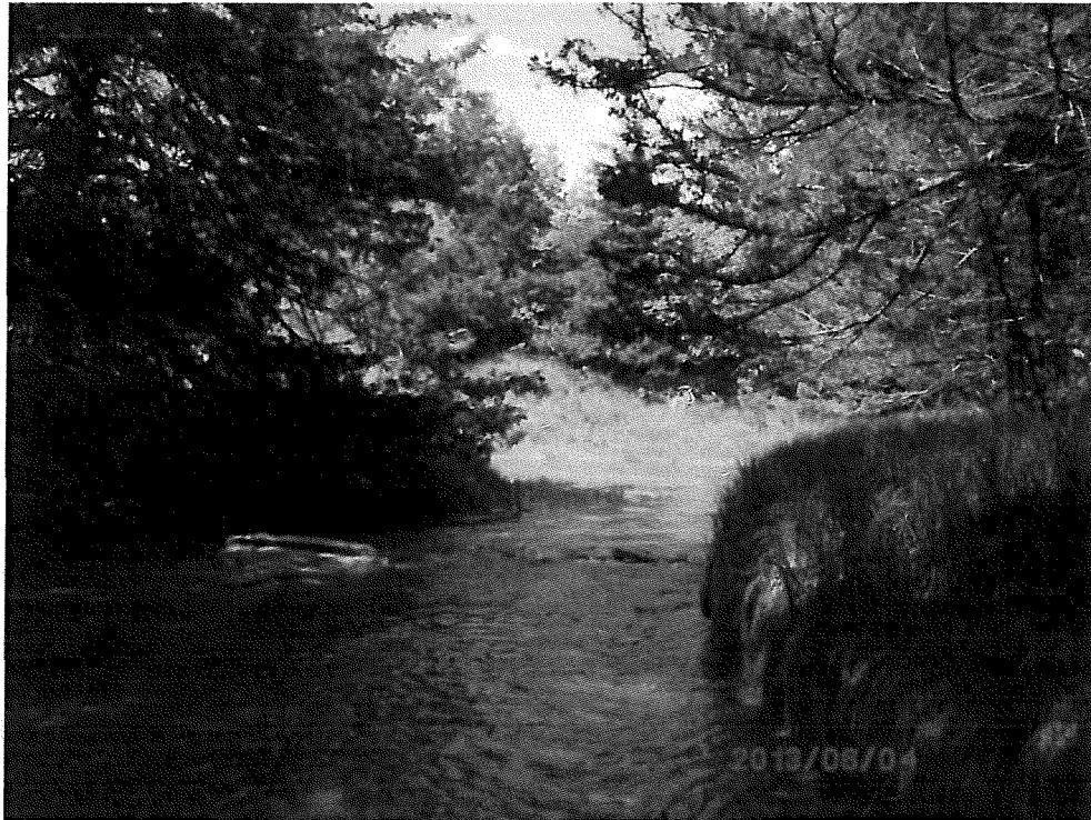
Photo 13 – Site 1 downstream measurement location looking upstream.