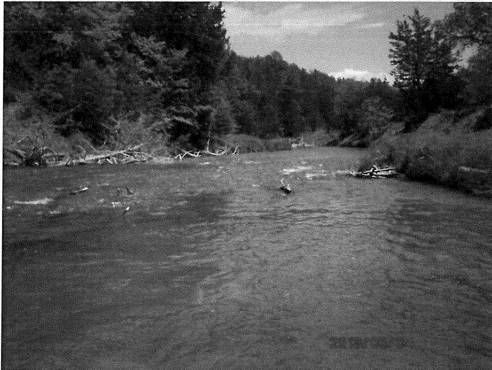
Photo 38 – Site 4 midstream measurement location looking downstream.