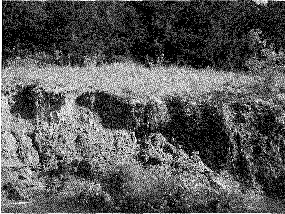
Photo 23 – Site 2 midstream measurement location looking to left bank.