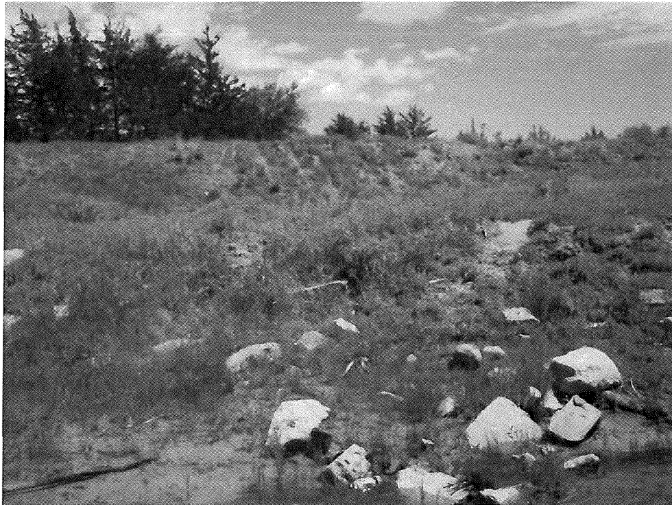
Photo 8 – Site 1 upstream from culvert measurement location looking to right bank.