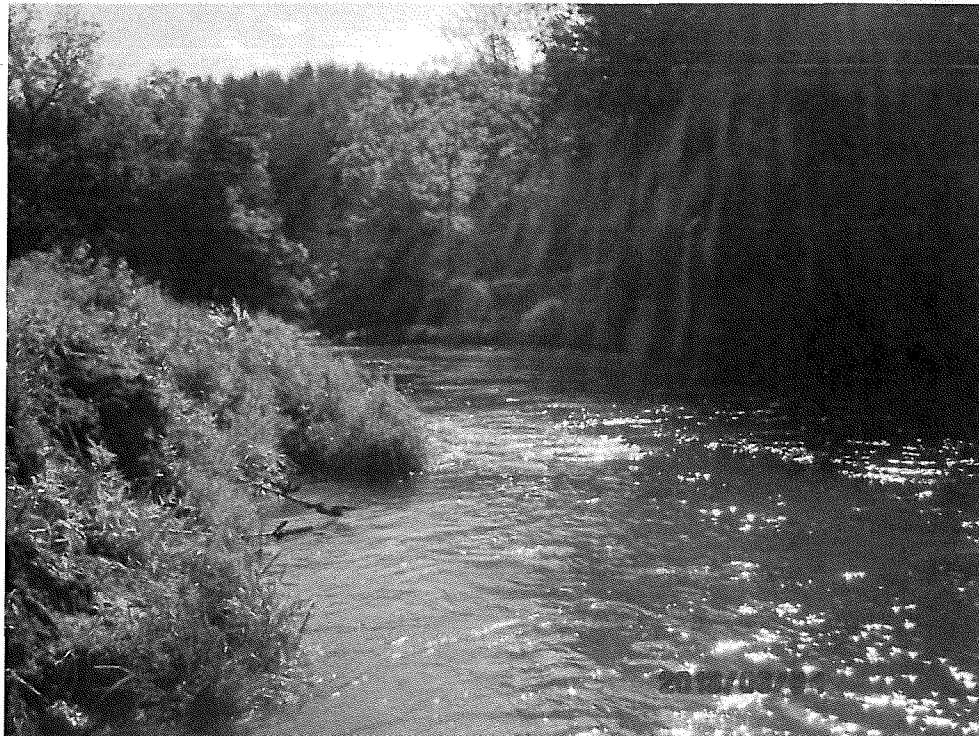
Photo 22 – Site 2 midstream measurement location looking downstream.