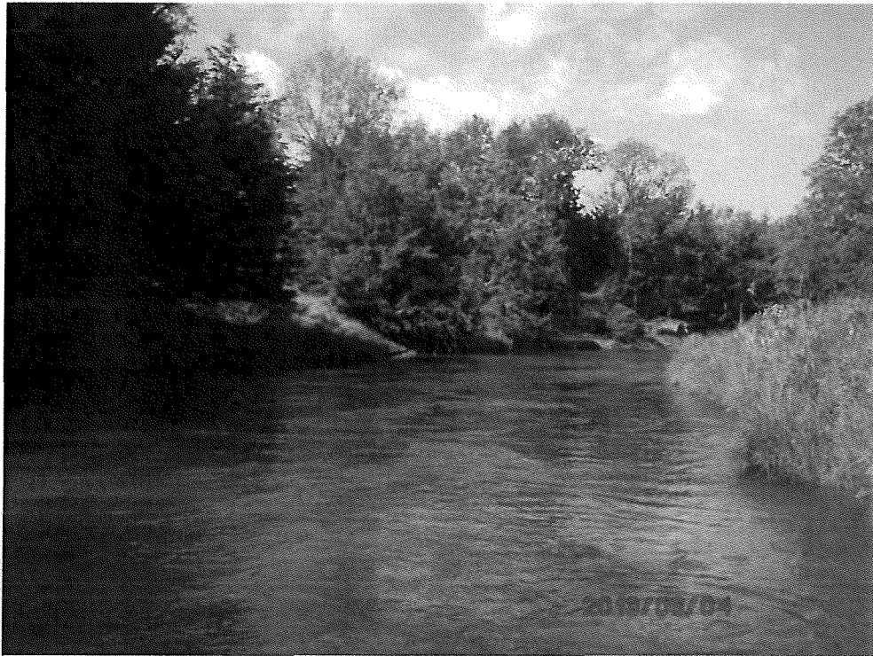
Photo 25 – Site 2 downstream measurement location looking upstream.