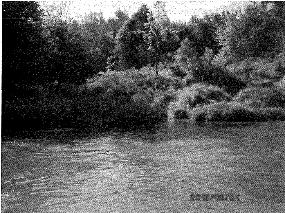
Photo 24 – Site 2 midstream measurement location looking to right bank