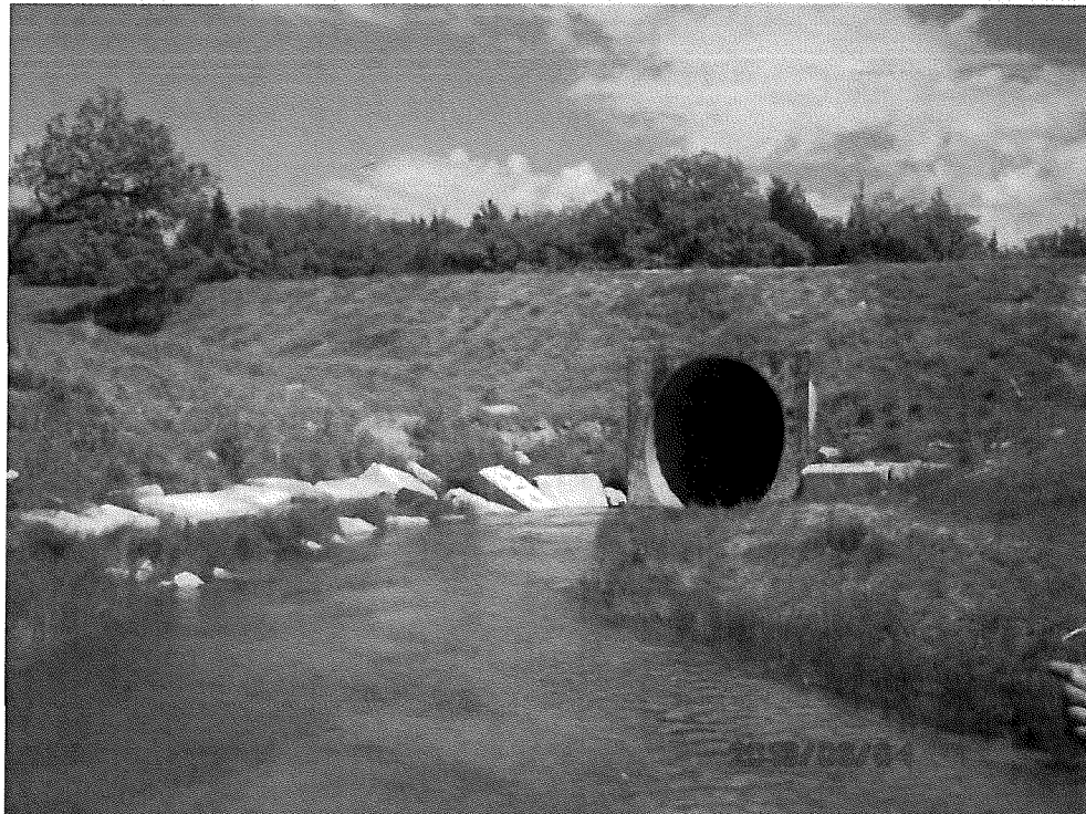
Photo 6 – Site 1 upstream from culvert measurement location looking downstream.