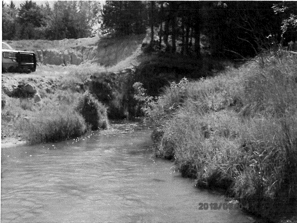
Photo 5 – Site 1 upstream from culvert measurement location looking upstream.