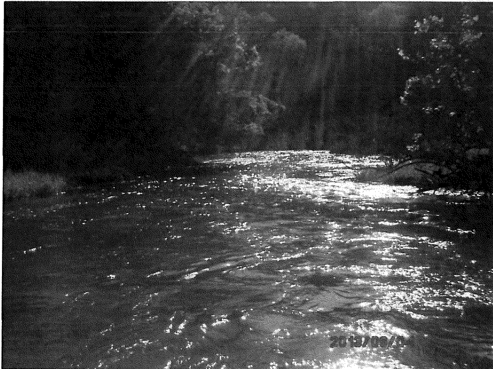
Photo 26 – Site 2 downstream measurement location looking downstream.