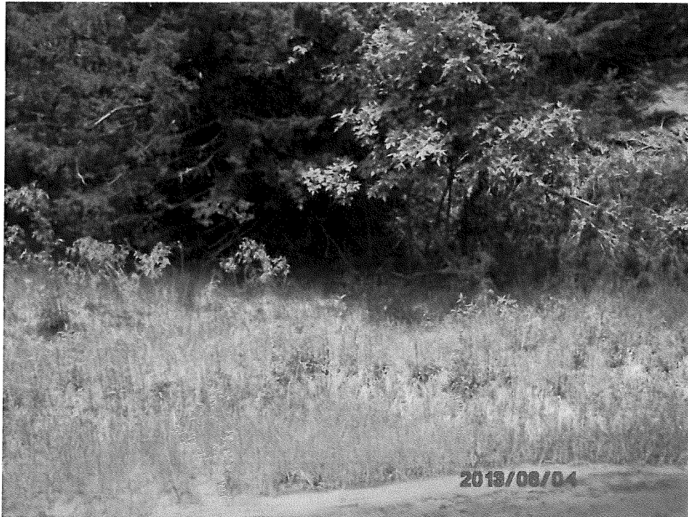
Photo 11 – Site 1 downstream from culvert measurement location looking to left bank.