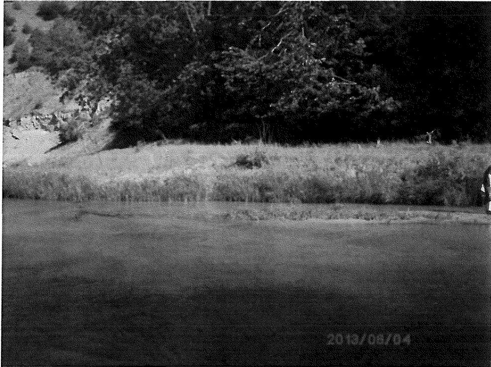
Photo 19 – Site 2 upstream measurement location looking to left bank.