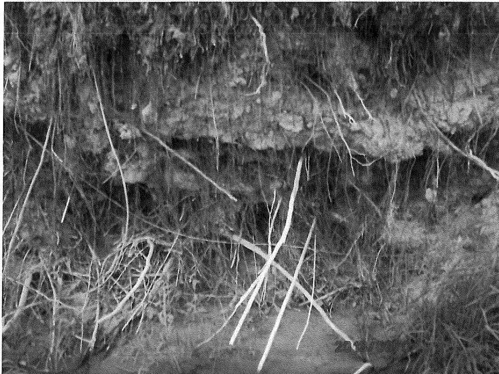
Photo 4 – Site 1 upstream measurement location looking to right bank.