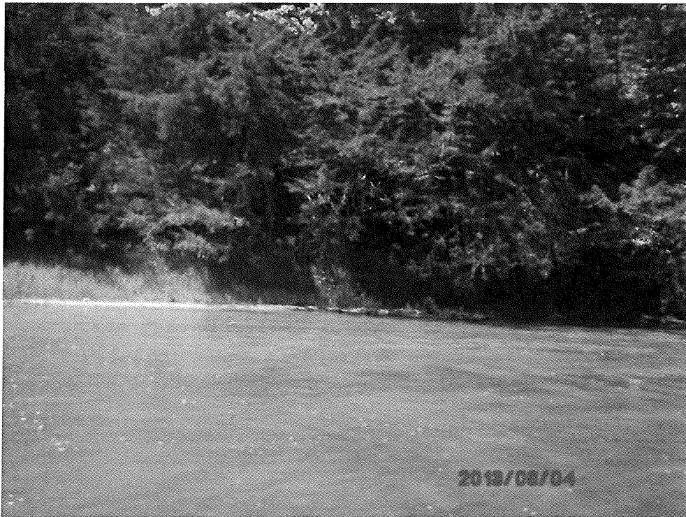
Photo 35 – Site 4 upstream measurement location looking to left bank.