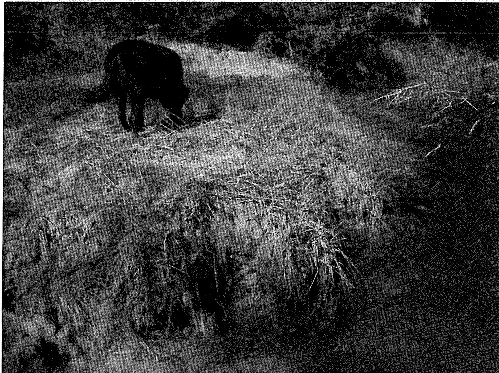
Photo 20 – Site 2 upstream measurement location looking to right bank.